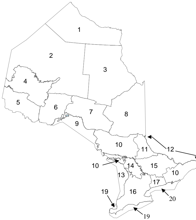
Appendix I New Fisheries Management Zones for Ontario's Sport Fisheries